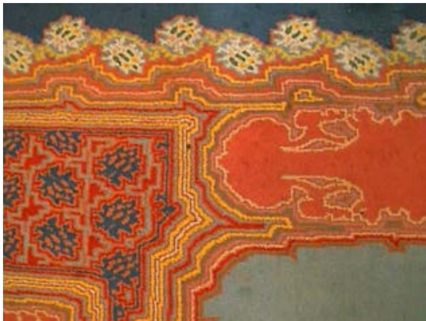
Figure 120. Detail of Artisjok 4 carpet, private collection.